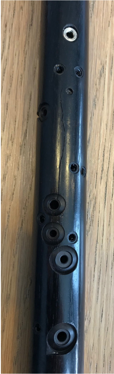
Cracked English horn before repairs.

With the oboe, there can be multiple valid approaches to so many problems. This gives repairers the chance to be very creative in our solutions to problems. It also keeps life very interesting for all of us.